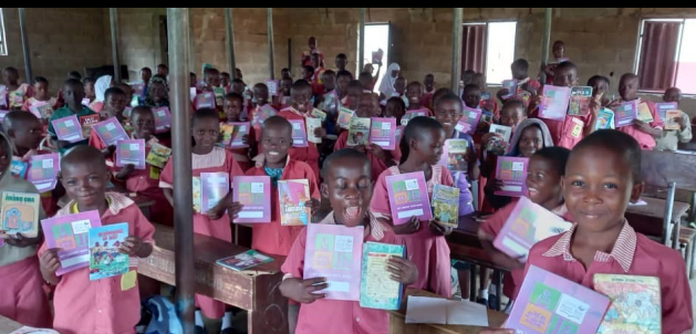
St John's Idi-Osi