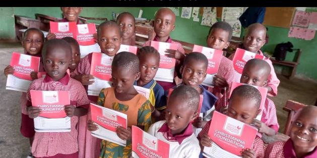
Methodist Primary Alasa

Continuing our commitment to maintain our built libraries we began work to refurbish the Christianna Foundation Library at Community High School Sawia in Oyo State. We first built this library in 2012 and it has served the school well for over 11 years. We replaced the weather beaten ceiling, fixed the tables and chairs and repainted the library outside and in. It is now bright, beautiful and ready to serve the community for the years to come.