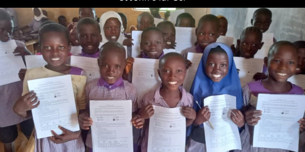
St James Olorunda